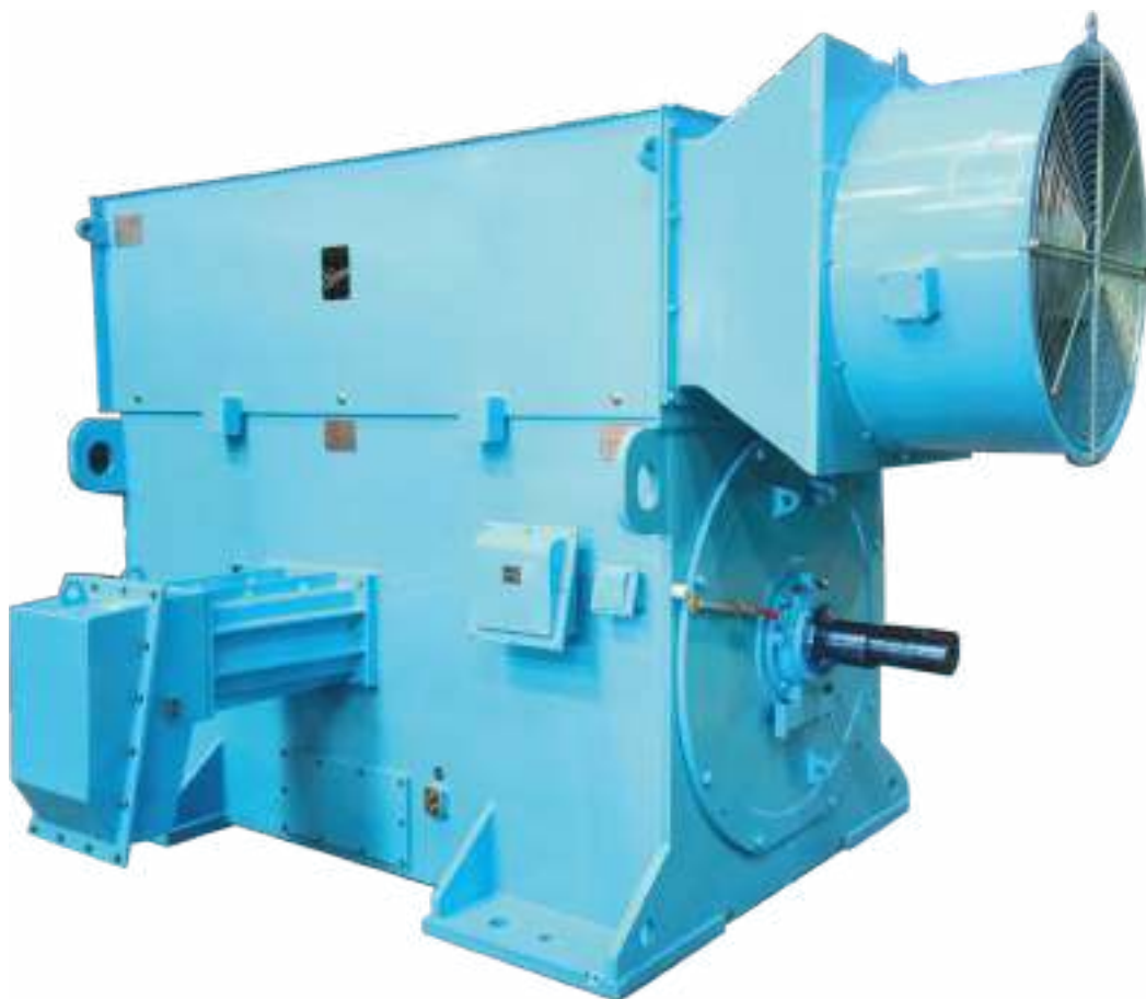
1400Kw, 11kv, 1000RPM, MPAF500HCSPL – HT Motor