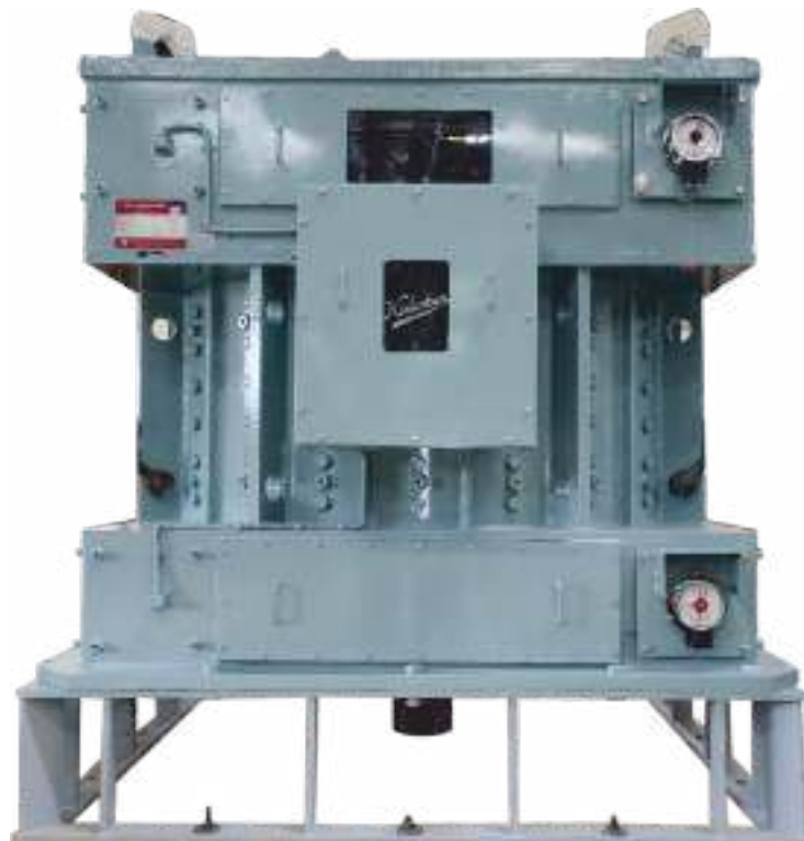
900kw, 750V, 110/230RPM, KLDC 3157 – DC Motor